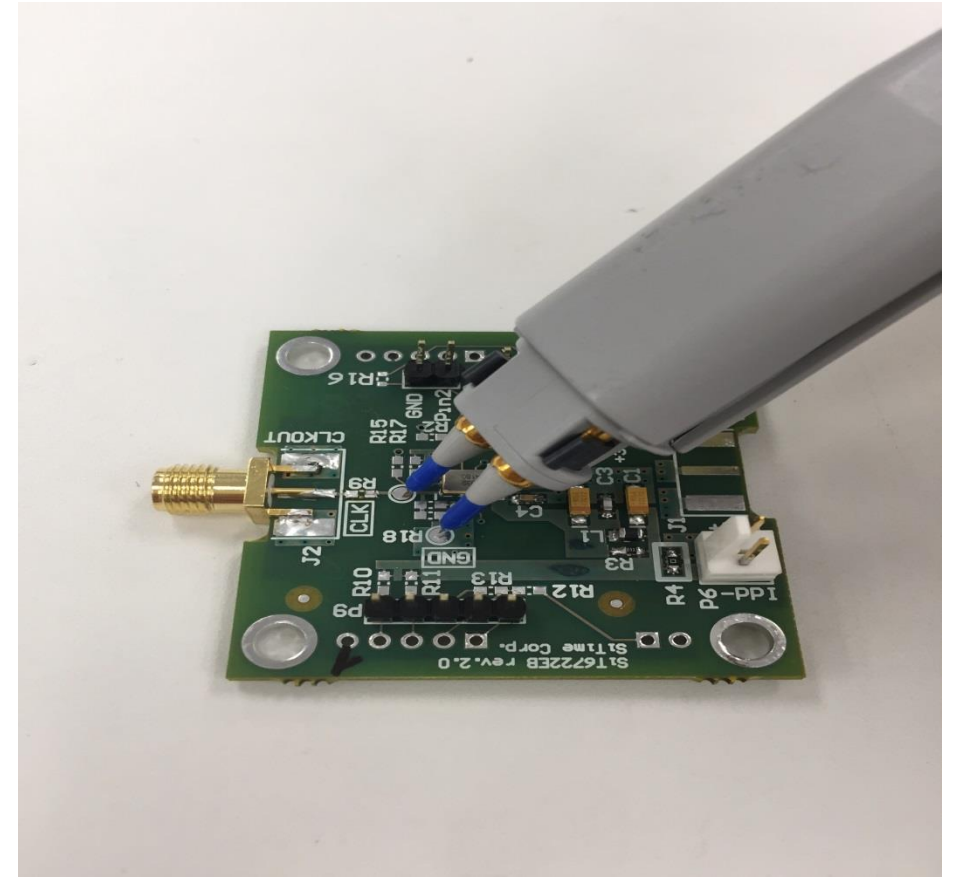
Figure 1: Proper Waveform capturing on SiT6722EB

Eliminating such distortion requires a probe with the lowest input capacitance and a low inductance ground lead. In addition, SiTime Super-TCXOs are typically configured for fast rise and fall times (1 ns or less) with 15 pF load. It is therefore critical that the probe tip ground be as short as possible, lowest inductance, and the return path for the ground be located as close as possible to the trace carrying the RF logic signal. Please refer to Figure A2 for test point locations on the SiT6722EB and an example of proper probing.